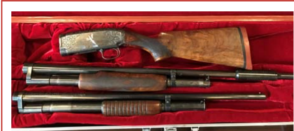
Winchester Model 12 20 Gauge Shotgun with Silver Inlaid and Custom Engraving