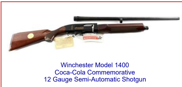
Winchester Model 1400 Coca-Cola Commemorative 12 Gauge Semi-Automatic Shotgun