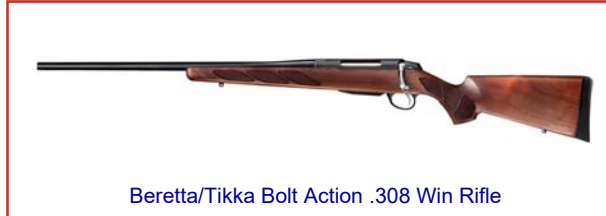
Beretta/Tikka Bolt Action .308 Win Rifle