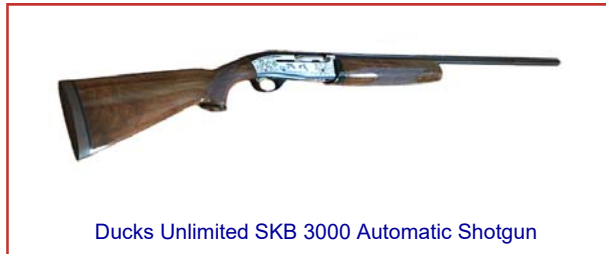
Ducks Unlimited SKB 3000 Automatic Shotgun