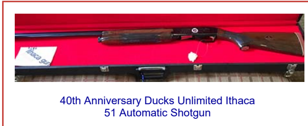
40th Anniversary Ducks Unlimited Ithaca 51 Automatic Shotgun